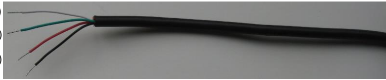
183mm cable P/N TelINF/TRRSMC6

White (VOX) Green (Jacked in) Red (VOX) Black (Jacked in)