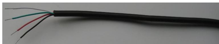
183mm cable P/N TelINF/TRRSMC6

White (Off Hook) Green (Jacked in) Red (Off Hook) Black (Jacked in)