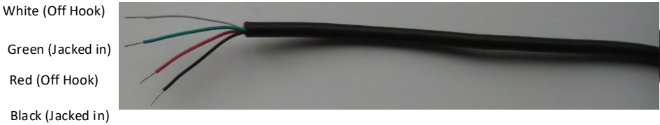
183mm cable P/N TelINF/TRRSMC6