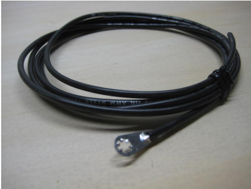
180mm 14G ground wire; attach to suitable ground point on location