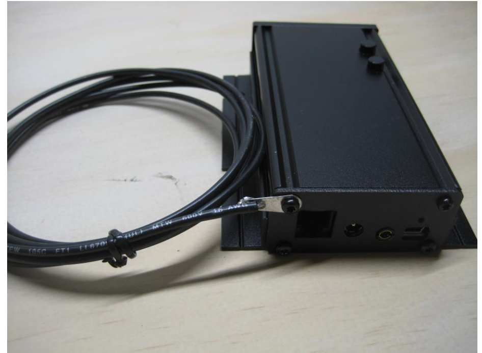
Lug may be attached to back cover plate screws as shown